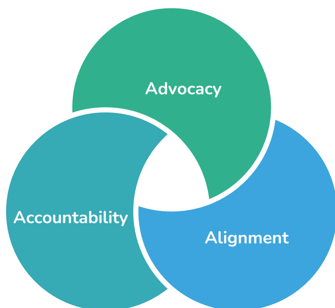
Fig. 1: UHC2030's three pathways for change

UHC2030’s collective efforts on advocacy , accountability and alignment in 2024–2027 can help drive progress to ensure that, by 2030, everyone, everywhere, has access to the full range of services they need, when and where they need them, without financial hardship.